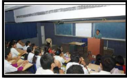
PG Orientation Program, KMSDCH, SVDU