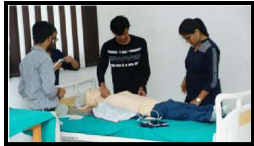
ACLS WORK STATION, CASE SITUATION OF EMERGENCY SITUATION