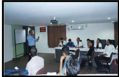
PG SYNOPSIS WRITING WORKSHOP, SBKSMI&RC, SVDU