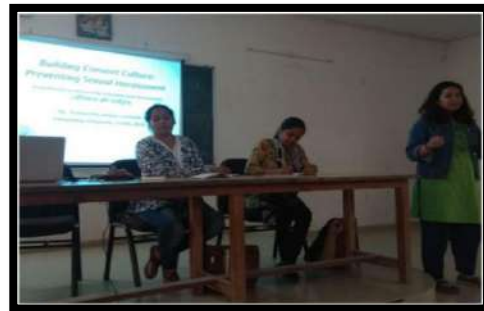
STUDENTS PARTICIPATING HUMAN VALUES, SVDU