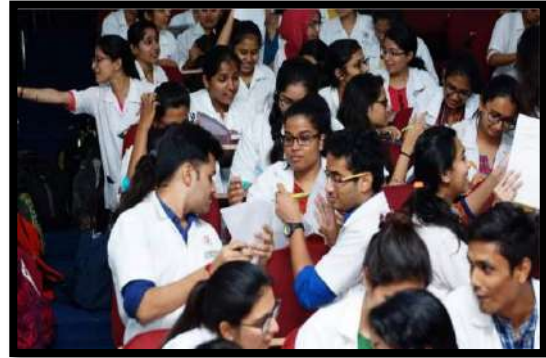
STUDENTS GROUP ACTIVITY, HUMAN VALUES PROGRAM, KMSDCH, SVDU