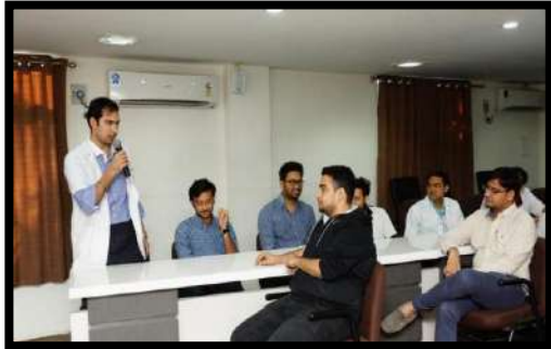
GROUP ACTIVITY AT PGMET WORKSHOP, SBKSMI&RC, SVDU