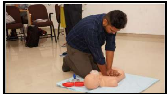
STUDENTS LEARNING CPR on MANNEQUIN, LABDHI SIMULATION CENTRE, SVDU