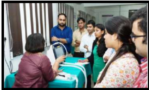
ACLS ALGORITHM BY INSTRUCTOR