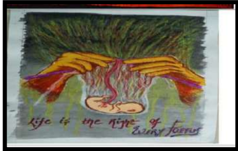
HUMAN RIGHTS DAY CELEBRATION, KMSDCH, SVDU