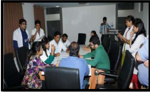
PG MET WORKSHOP, SBKSMI&RC, SVDU