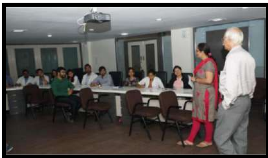
COMMUNICATION SKILL WORKSHOP BY FACULTY