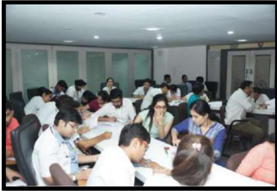
GROUP ACTIVITY AT PG SYNOPSIS WRITING WORKSHOP, SBKSMI&RC, SVDU