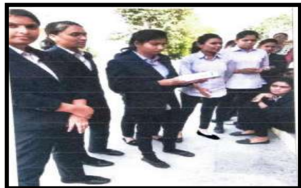
STUDENTS ACTIVITY FOR HUMAN VALUE DEVELOPMENT, SVDU