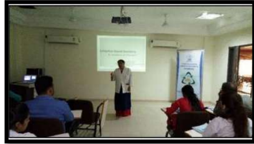
PG EBES SESSIONS, SVDU