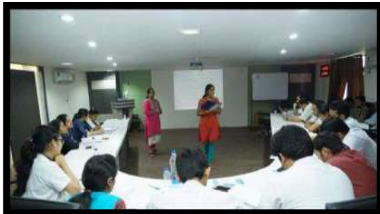
CRITICAL APPRAISAL OF ARTICLES, EBES WORKSHOP, SVDU