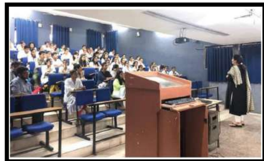
ENGLISH ENRICHMENT CLASS, KMSDCH, SVDU